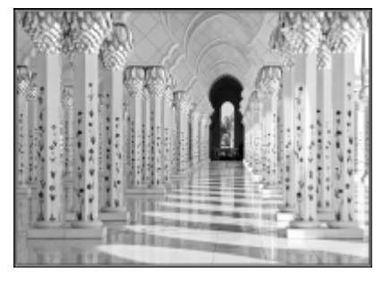
Grand Mosque 5 Barbara Hammer not accepted